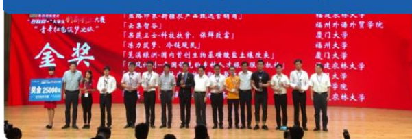
2018 "Internet plus" Competition, Golden prize