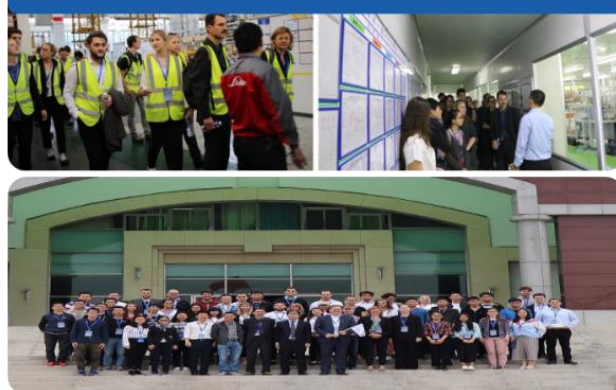
2018 Sino-German Study Week